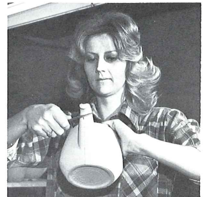
(4) Trimming with knife.