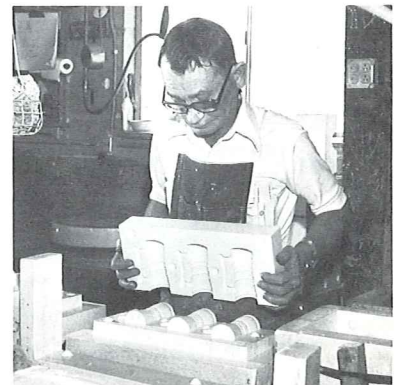
(8) Making a Mold