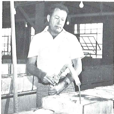
(1) Slip Casting