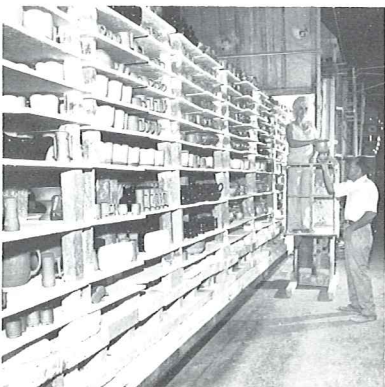
(7) Stacking kiln for firing.

Frankoma is hand crafted earthenware pottery. Frankoma is a complete pottery; we dig our own clay in Sapulpa, process it; develop and mix all our own glazes and colors; make our own molds and create our own designs.